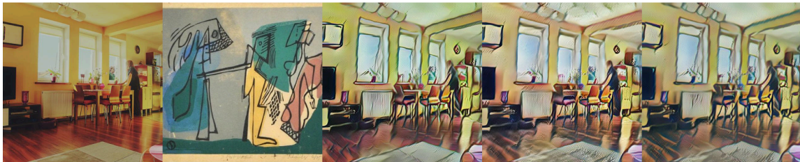
Fig. 5. Ablation study on noise level. From left to right: A target, a style image and stylized images with the noise distribution supports of [0.5, 1.5] , [0.25, 1.75] , and [0, 2] . Best viewed in color and zoom.