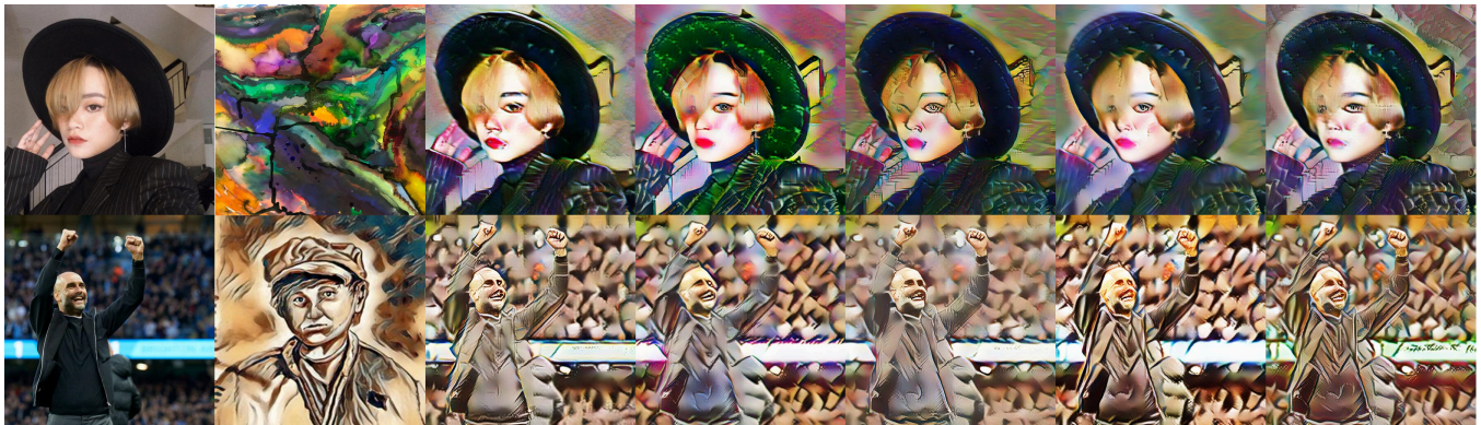
Fig. 4. Our results with random targets and styles from Internet. The first and second columns are targets and styles, respectively. The others are generated images. Best viewed in zoom and color.