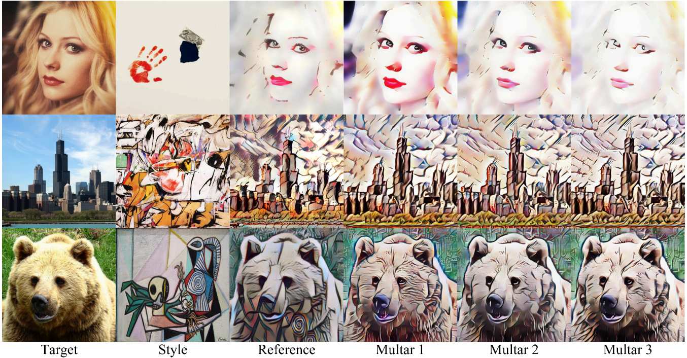
Fig. 3. Qualitative results against AdaIN [8] (the first two rows in the third column) and MT [9] (the last row in the third column). The AdaIN results are taken from the official Github repository. The MT results are obtained by running a re-implementation on a Github repository. We exhibit three different images produced by injecting different one-mean uniform noises. Best viewed in zoom and color.